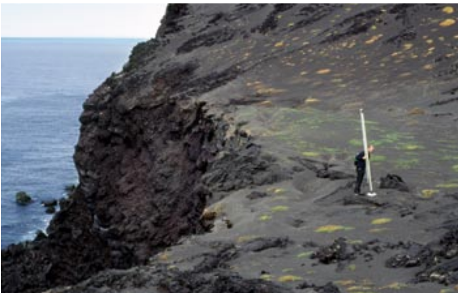
Fig. 3. Levelling performed in 2002, with the invar rod at benchmark 628. This is probably the last picture of that benchmark as the ground is cracked and the sea erosion will consume it.