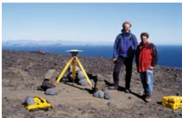
Fig. 4. Measurements of the GPS station SURG.

2000 and 2002. In the 1992 survey kinematic GPS was also carried out at a number of points, see Einarsson et al. (1994). Geographic descriptions of the GPS points are given by Ólafsdóttir et al. (2003), who also include a complete list of the major campaigns in which some of the GPS measurements on Surtsey were included. In the first GPS-measurements, in 1992, only benchmark number 621 was occupied, now called SURS and it was re-measured in the year 2000. A new GPS-point was measured on benchmark RH9205 named SURN and it is situated in palagonite tuff in the saddle between the two main peaks (Fig. 2). During the 2002 survey SURS and SURN were re-occupied and two new points were added, one in palagonite tuff on the crest of the western mountain, called SURG, with the inscription NE08 (Fig. 4), and a second in the