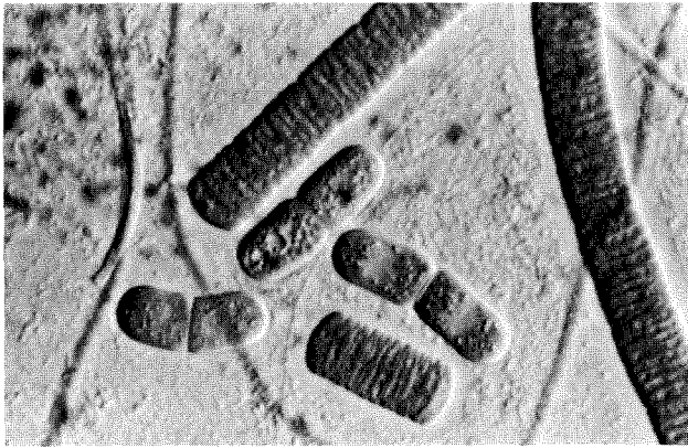
Fig. 1: Raw culture of Synechococcus with Oscillatoria fracta and Schizothrix lardacea .