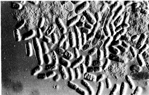
Fig. 3: Same culture as in figure 2, showing more pronounced 'involutionary forms.'